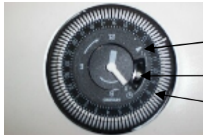
(fig. 3 – Timer)

To set the correct time on the Timer (fig. 3), turn the outer ring of tags until the clock face reads the correct time. Note: this is a 24 hour clock so ensure the small white arrow head on the outer clock face is pointing to the correct hour of the 24 hour time period around the outer perimeter of the timer face.